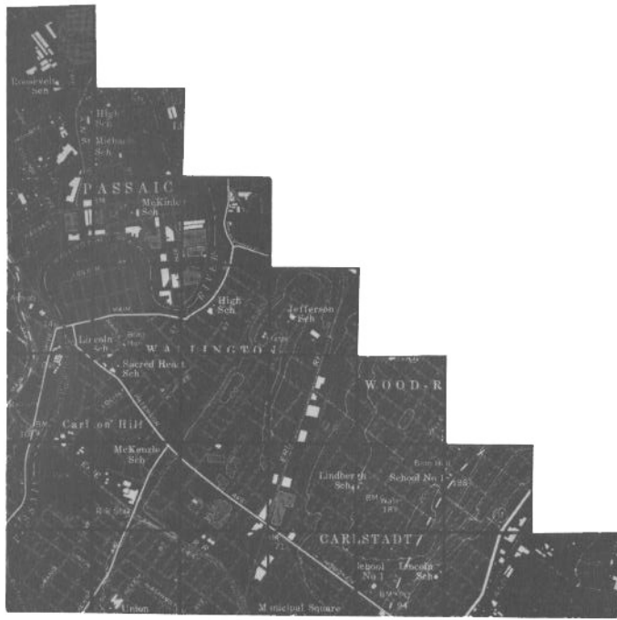
Negative Map Showing Region of the Monuments along the Passaic River.

or any subsequent handling of this film is without other warranty or liability. EASTMAN KODAK COMPANY DO NOT OPEN THIS CARTRIDGE OR YOUR PICTURES MAY BE SPOILED—12 EXPOSURES—SAFETY FILM—ASA 125 22 DIN.