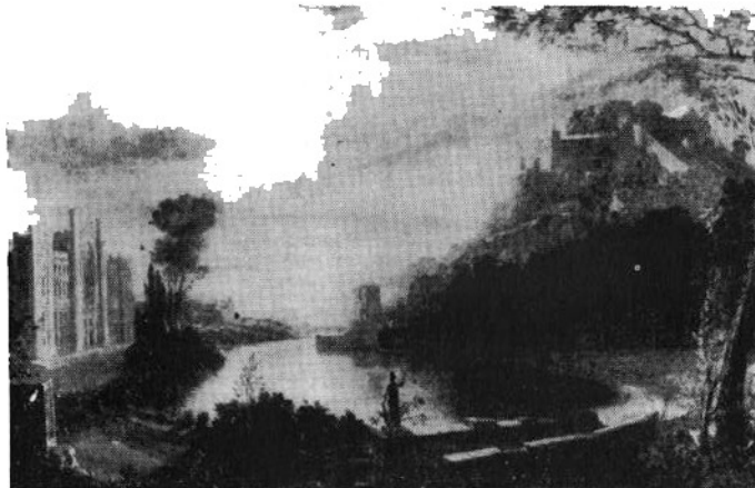
"Allegorical Landscape" by Samuel F. B. Morse, displayed at Marlborough-Gerson Gallery