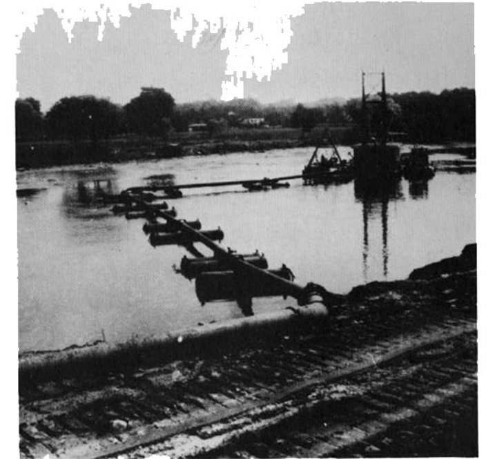
Monument with pontoons: The Pumping Derrick.

that supported the shoulders of a new highway in the process of being built. River Drive was in part bulldozed and in part intact. It was hard to tell the new highway from the old road; they were both confounded into a unitary chaos. Since it was Saturday, many machines were not working, and this caused them to resemble prehistoric creatures trapped in the mud, or, better, extinct machines—mechanical dinosaurs stripped of their skin. On the edge of this prehistoric Machine Age were pre- and post-World War II suburban houses. The houses mirrored themselves into colorlessness. A group of children were throwing rocks at each other near a ditch. "From now on you're not going to come to