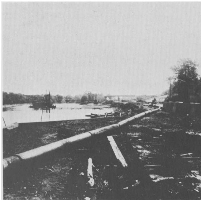
The Great Pipes Monument. (Photo: Robert Smithson)

Nearby, on the river bank, was an artificial crater that contained a pale limpid pond of water, and from the side of the crater protruded six large pipes that gushed the water of the pond into the river. This constituted a monumental fountain that suggested six horizontal smokestacks that seemed to be flooding the river with liquid smoke. The great pipe was in some enigmatic way connected with the infernal fountain. It was as though the pipe was secretly sodomizing some hidden technological orifice, and causing a monstrous sexual organ (the fountain) to have an orgasm. A psychoanalyst might say that the landscape displayed "homosexual tendencies," but I will not draw such a crass an-