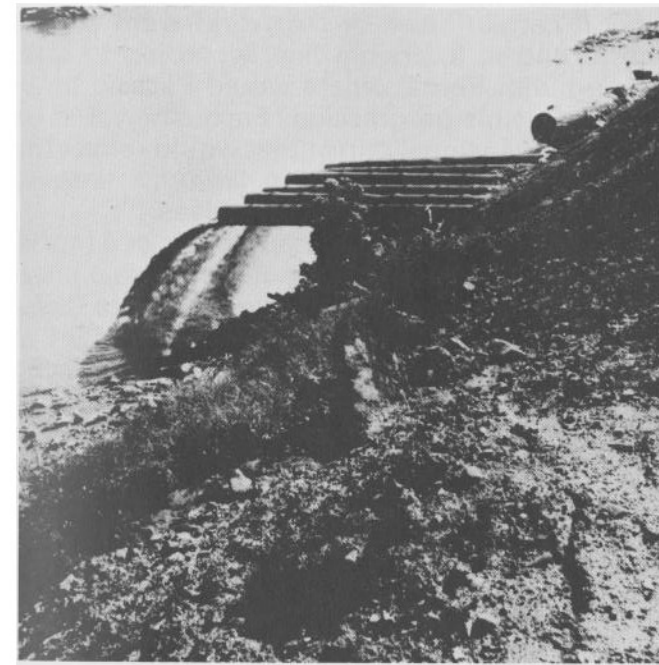
The Fountain Monument—Bird's Eye View.

Passaic seems full of "holes" compared to New York City, which seems tightly packed and solid, and those holes in a sense are the monumental vacancies that define, without trying, the memory-traces of an abandoned set of futures. Such futures are found in grade B Utopian films, and then imitated by the suburbanite. The windows of City Motors auto sales proclaim the existence of Utopia through 1968 WIDE TRACK PONTIACS—Executive, Bonneville, Tempest, Grand Prix, Firebirds, GTO, Catalina, and LeMans—that visual incantation marked the end of the highway construction.