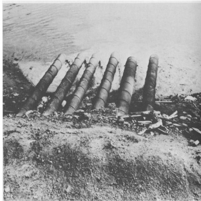
The Fountain Monument: Side View.

Across the river in Rutherford one could hear the faint voice of a P. A. system and the weak cheers of a crowd at a football game. Actually, the landscape was no landscape, but "a particular kind of heliotypy" (Nabokov), a kind of self-destroying postcard world of failed immortality and oppressive grandeur. I had been wandering in a moving picture that I couldn't quite picture, but just as I became perplexed, I saw a green